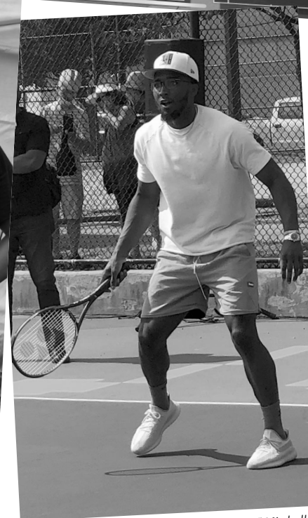
Donovan "Spider" Mitchell Jr.

Congratulations! To Hunterdon Central Girls Tennis 2021 Hunterdon/Warren/Sussex county champions